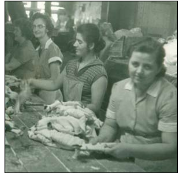
Mudry Fur Dressers, Montréal, 1950s

Because Sister Plamondon possessed a rare combination of intelligence, passion, eloquence, and flam-