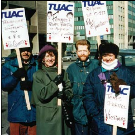
Québec members take their message to the streets