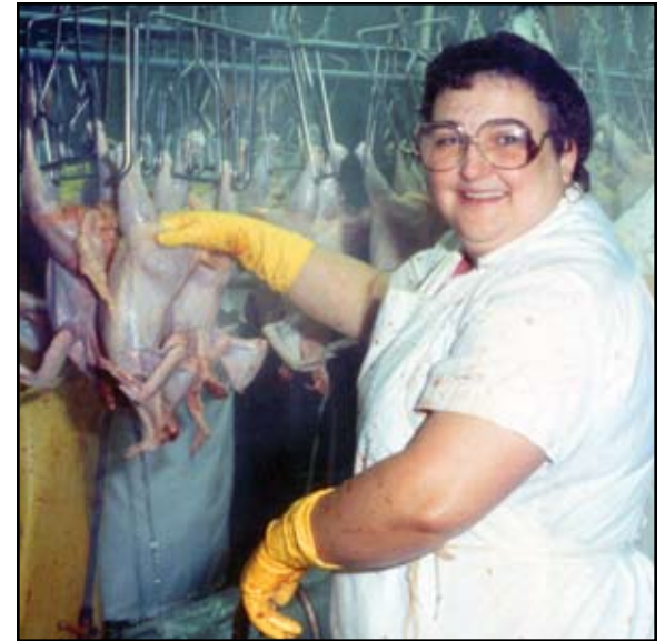
Poultry processing at Maple Lodge Farms, Ontario

Lifelong learning builds opportunities and security