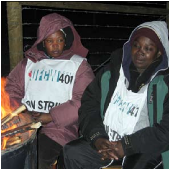
On the picket line, Brooks, Alberta, 2005