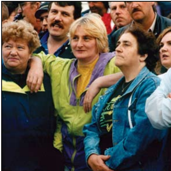
Fisheries rally in Plum Point, Northern Peninsula, Newfoundland & Labrador, 1990s