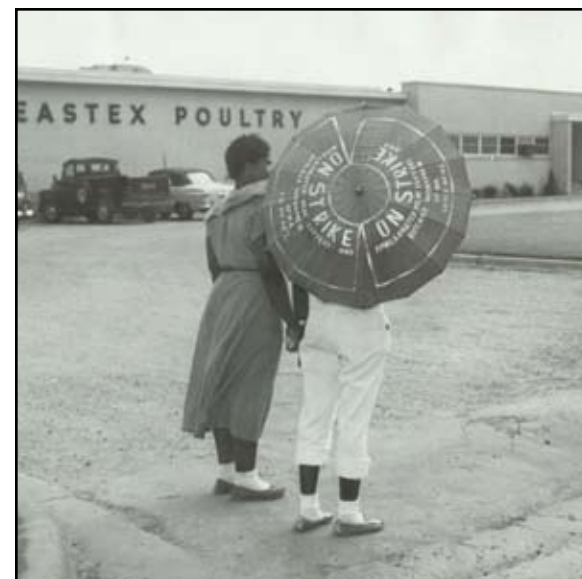
Focused on the Future; Empowered for Change