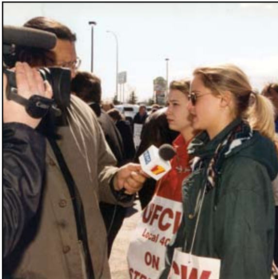
Alberta striker makes her case to the media

also dedicated much effort to the pursuit of social democracy. A few examples: