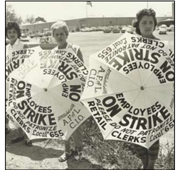
Retail clerks on the picket line, date unknown