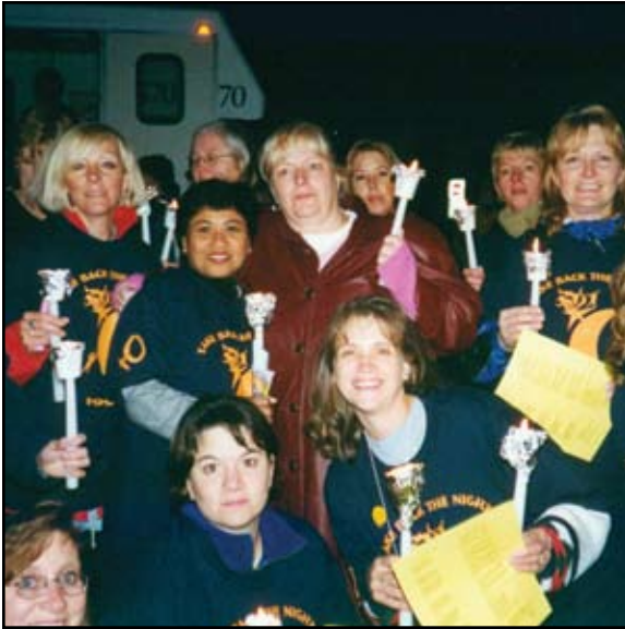
UFCW Canada women at one of many Take Back the Night demonstrations across the country