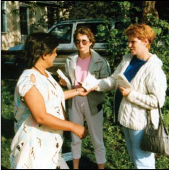
Organizing migrant workers in British Columbia