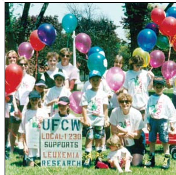
Leukemia research fundraising in Cobourg

But UFCW Canada women are a brave and resourceful troop who will – without a doubt – blaze as many trails in this century as they did in the last one.