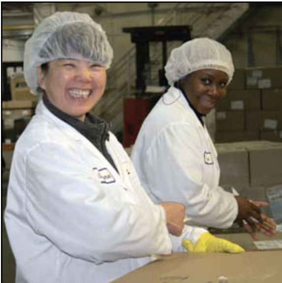
UFCW Canada women members in food-processing