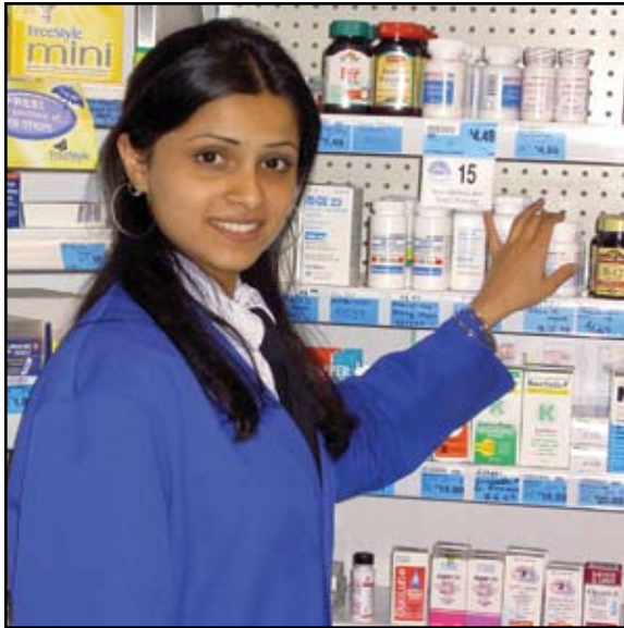
Pharmacy member in Ontario store